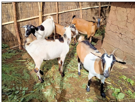
Goats in Nsantu Village

We included a video of the distribution of one of these goats on our WhatsApp Broadcast on 29th February. Dan wrote that they were very thankful for the provision of these goats.