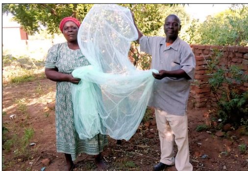
Distribution of Nets in Magoti Village

Exchange Rates: February 2024 £1 = MK2,160 July 2024 £1 = MK2,260