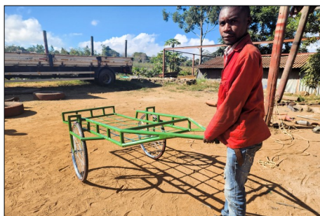
Bicycle Ambulance in Makanjira Village

On 15th January, we sent MK750,000 (£344) for a bicycle ambulance. It has been located in Makanjira village and was provided at the time when the people in this village were facing serious problems with cholera patients needing to be taken to the nearest clinic and also for carrying the dead bodies from the hospitals to their homes for burial.