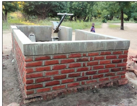
Well in Mtantha Village

We are currently including several videos of the construction of these wells in our Faith in Action WhatsApp Broadcast. If you would like to receive