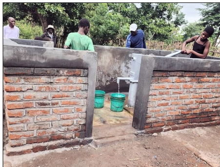
Well in Mbobo Village